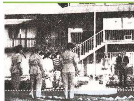
MDKG College (Old Building)