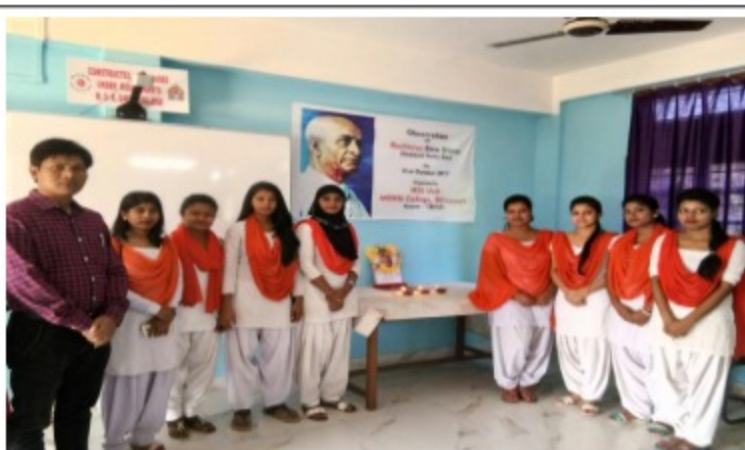
Programme Officer and Students of the college