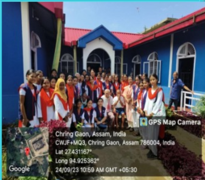
NSS Pledge Taking ceremony