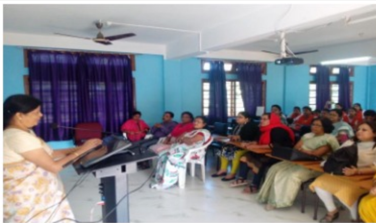
Teachers and students of the college